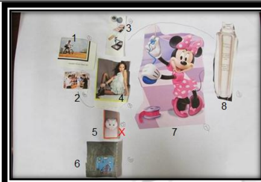
3. Lily, female, 10 years old