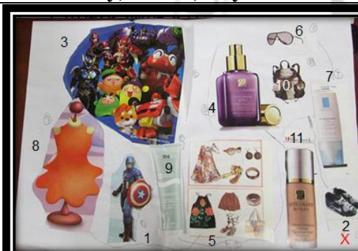
5. Anna, female, 10 years old