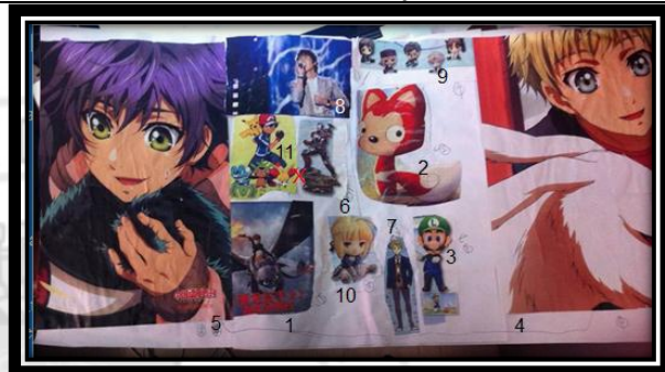
4. Desmond, male, 10 years old