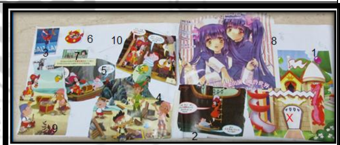
6. Andy, male, 7 years old