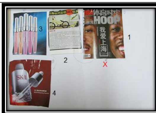
8. Leslie, male, 12 years old