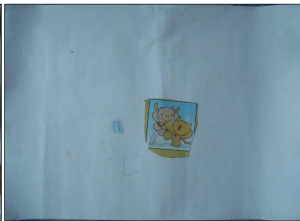
Figure 2: Mark's collage

The analysis focused on a few main aspects. First, in terms of the mode of expression and the non-verbal cues, I observed the quality of their tone, their enthusiasm while telling the story as well as the frequency of their utterance, avoidance of eye contact and silences. From these observations, we can further manifest the latent emotions of each child toward a certain event or people. Second, the physicality of the collage, i.e. the distance, the positive and negative meanings of each picture, provided comprehension about the meaning of pictures placed far apart from each other, and the significance of choosing aggressive or loving pictures to make the collage. So, we can have a better understanding of the hidden metaphors of each story. Third, I interrogated the family stories or narratives. I have asked questions about their family members, their happy memory as well as unhappy one. Interestingly, most of their memorable reminiscences included family members. My goal here was to combine the cues from the collages and their mode of expression with all family stories to form a holistic picture of each child's perceptions of family. Finally, by comparing the different stories, observing their distance and noting their emotion, I can understand the relationship pattern of children in single-parent family and how they adjust themselves through specific settings.