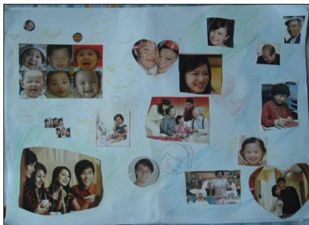
Figure 1: Mandy's collage